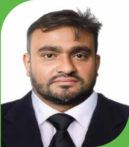
HARUN OR RASHID